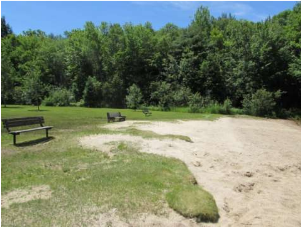
Figure 1. Jaspen Park, Bala shoreline